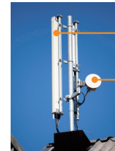
1 sector antenna